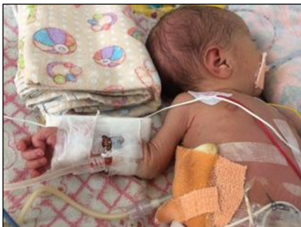
Figure 3: Rt sided intercostal tube drainage showing Chyle.

Baby was managed conservatively. With NPO, Broad spectrum antibiotics and TPN. Intercostal chest tube drain was put on right side and chyle drained though tube was averaged at 100ml/day for first 2 days. But baby developed respiratory acidosis with increased work of breathing on ventilator after two days. Repeat chest X-ray showed left sided pleural effusion (Figure 2) for which another intercostal tube was put on left thorax. The combined collection from both sides was around 250 ml/day. Since the drainage was high; Octreotide infusion was started @1 mic/kg/hr and gradually increased up to 4 mic/kg/hr over 3 days. There was remarkable decrease in chyle collection on day 3 of starting therapy. Due to improvement in respiratory parameters baby was gradually weaned off ventilator and extubated after 7 days of ventilation. As chyle loss decreased, Octreotide infusion was gradually tapered by 0.5 mic/kg/day and stopped after 8 days of therapy. During the period of octreotide therapy serum glucose, electrolytes were meticulously monitored. We didn't find any abnormalities in these parameters. Right intercostal chest tube was removed first followed by left after 11 days of therapy. Gradually feeds rich in medium chain triglyceride was initiated, baby tolerated well and was gaining weight at the time of discharge.