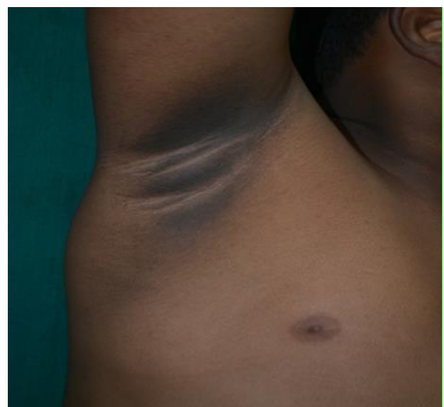
Figure 2: Grade 3 acanthosis nigricans over axilla in a 12 year male child.