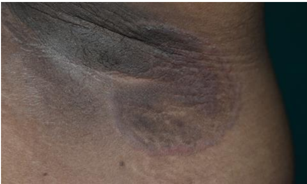
Figure 4: Well defined annular lesion of tinea over axilla and underlying acanthosis nigricans in a 10 year female child.