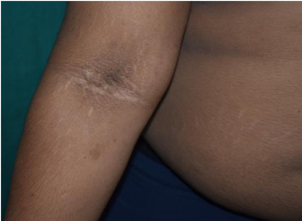
Figure 3: Striae distensae over cubital fossa and over abdomen in severely obese 15 year male child.