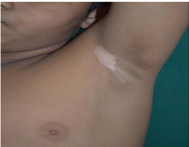
Figure 5: Single patch of focal vitiligo over left axilla with underlying acanthosis nigricans grade 1 in a 6 year old male child.