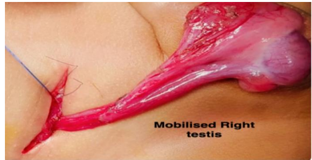
Figure 5: Mobilized right testis.