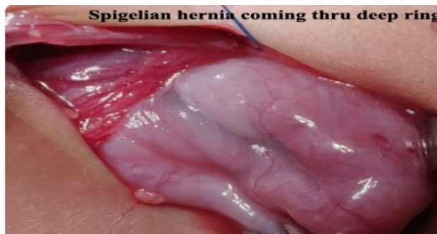
Figure 2: Spigelian hernia coming through deep ring.