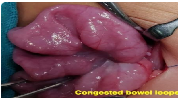
Figure 3: Congested bowel loops.