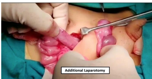
Figure 4: Additional laparotomy.