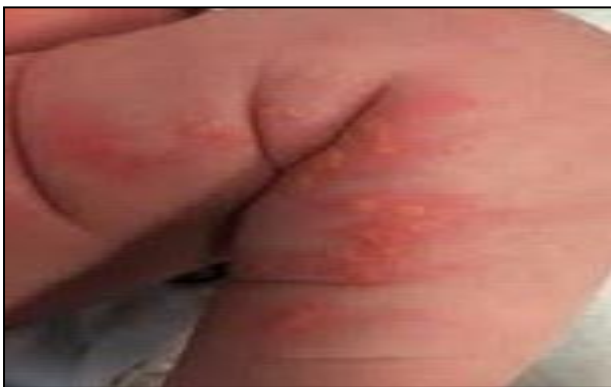
Figure 1: Skin lesions.

Complete blood cell (CBC) test and urine workup were done. CBC showed raised total leukocyte counts (22,500/mm 3 ) and eosinophilia (14%). C-reactive protein (CRP) was negative. Liver function test, kidney function test and serum electrolytes showed no abnormality. TORCH (Toxoplasma, Rubella, Herpes) screen was negative. Cranial ultrasound was found to be normal. Retinal vascular abnormalities were noted during fundus examination by an ophthalmologist. The