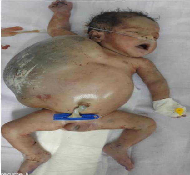
Figure1: Giant lymphangioma.

abdominal wall was present (Figure 1). No other external congenital anomalies were noted. Respiratory system examination revealed absent air entry over right hemithorax and reduced air entry over left hemithorax. Abdomen was uniformly distended, shiny with ascites. Bowel sounds were heard. Other systemic examinations were uneventful and were admitted in NICU.