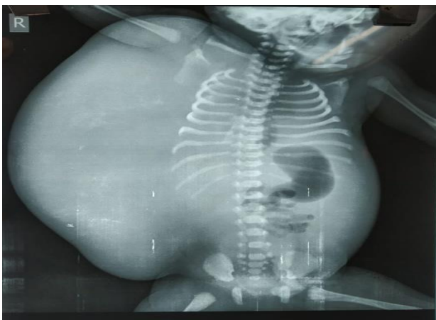
Figure 2: Chest X-ray with abdomen.

During NICU stay, neonate had respiratory distress and was started on CPAP with supportive measures. Baby went in for cardiopulmonary arrest at second hour of life and was revived with cardiopulmonary resuscitation, intubated and connected to mechanical ventilator. Intensive care support was continued. X-ray chest with abdomen revealed huge radio opaque mass over right hemithorax and abdomen with evidence of pleural effusion with ascites (Figure 2). Routine blood investigations were normal.