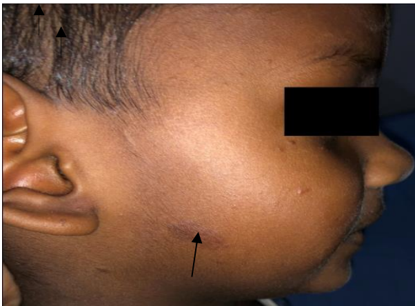
Figure 2: Shagreen patch.