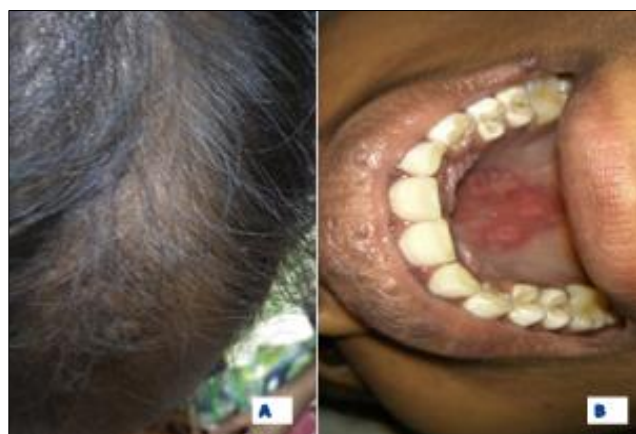
Figure 3: (A): Non scarring alopecia, (B): Ulcer over hard palate.

Dermatologic manifestations noted in 17 (68%) patients. Photosensitivity seen in 15 (60%), rashes over the body in 12 (48%) malar rash in 11 (44%), alopecia in 3 (12%), oral ulcers in 13 (52%) and one patient had cellulitis and gangrene of toes. The skin manifestations are shown in Figure 2 (Discoid lupus) and Figure 3 (Nonscarring alopecia (A) and ulcer over hard palate (B)).