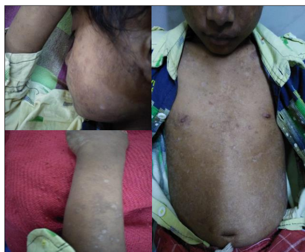
Figure 2: Cutaneous manifestation of SLE.