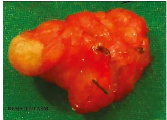
Figure 2: Hirschsprung’s disease-an extremely rare association.

Magnetic Resonance Imaging (MRI) showed no mass lesion at the presacral area.