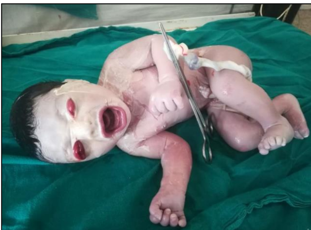
Figure 1: Collodion baby

Collodion baby is a form of congenital ichthyosis, which is characterized by the presence of cellophane/ parchment-like membrane which covers the entire body. 4 This results in profound contraction abnormalities of face- eyes, ears, and mouth. Other features include the presence of ectropion (eversion of the eyelids), eversion of the lips (eclabion), abnormalities in the development of face and mouth, anonychia (absence of finger and/or toe-nails, hypoplastic fingers, nose, and auricular cartilage, pseudo-contractions of limbs, and limited joint mobility. 5 Figure 1 shows a similar baby with thick hyper keratinized scaly skin with ectropion, eclabium, underdeveloped eyes and ears. The collodion membrane sometimes leads to restricted pulmonary function, digital vascular constriction, distal ischemia of the limbs, hyperhidrosis, poor sucking, erythema, and edema of the skin. These babies are at high risk for temperature instability (hypo/hyperthermia), respiratory difficulties, hypernatremic dehydration, electrolyte imbalances resulting in seizures, malnutrition, failure to thrive, and skin infection. These neonates are mostly born premature and the most common cause of death being dehydration and septicemia. 5