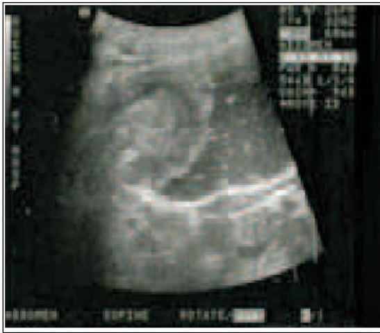
Figure 2: Ultrasound demonstration of the movement of mass with saline infusion.