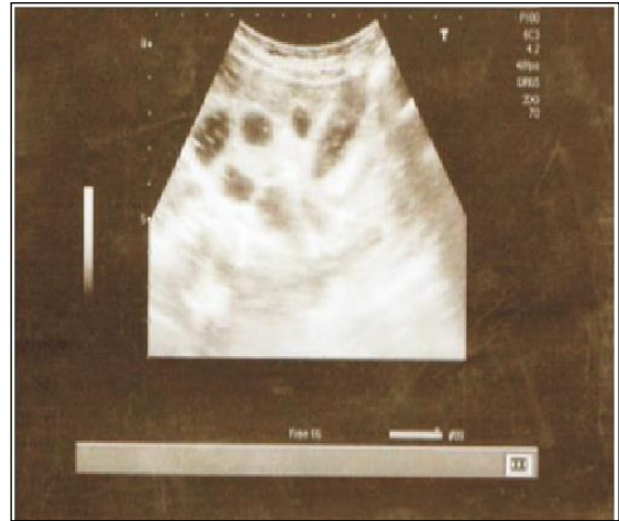
Figure 3: Ultrasound demonstration of the honeycomb sign of reduction of intussusception.

possibility of incomplete reduction of Intussusception. (Figure 3).