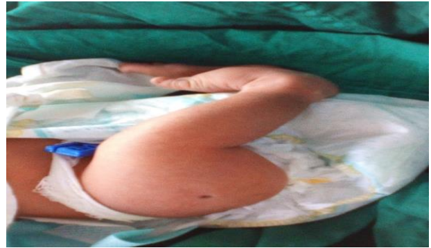
Figure 3: Thigh pit and talipes equines deformity of feet.

On lateral aspect of both thighs' pits were present (Figure 3). Spine and genitalia were normal. Cardiorespiratory and central nervous system examination were normal. Radiographic imaging of lower limbs (Figure 4 and 5) showed hypoplastic femurs. Renal and cranial ultrasound were normal.