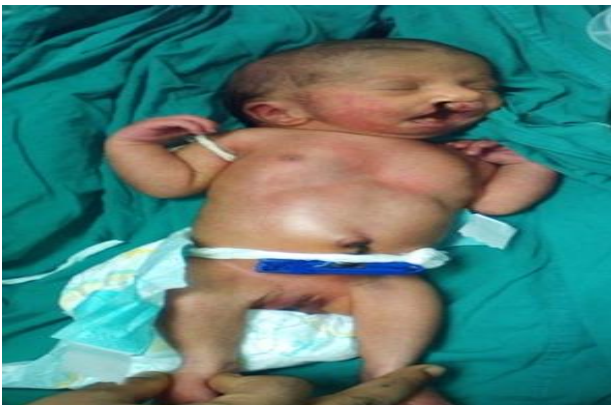
Figure 2: Phenotypic features of the baby with FH-UFS showing facial dysmorphism, normal upper limbs and hypoplastic femurs.

At birth, baby cried immediately, was active, eutermic with HR-140/min regular, RR-46/min regular. The head circumference was 34 cm and length were 36.5 cm. On examination dysmorphic facies (Figure 1) were noted which included cleft palate and cleft lip, low set ears, retrognathia prominent occiput and dolichocephaly with normal upper limbs. Lower limbs showed bilateral short femur with flexion and adduction deformity (Figure 2).