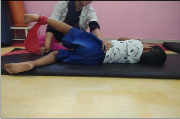
Figure 3: Hip abductors strengthening exercises.