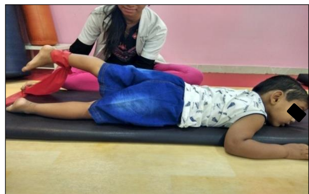
Figure 2: Hip extensors strengthening exercises.