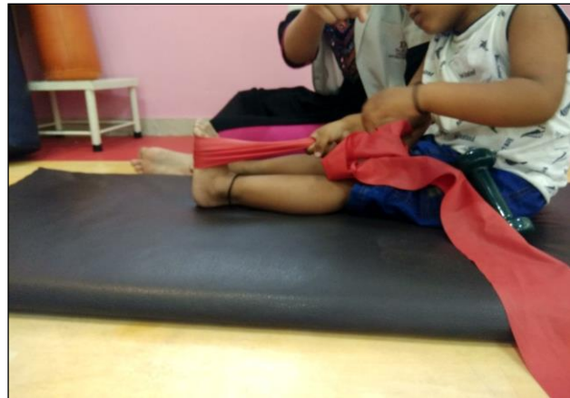
Figure 7: Ankle Plantarflexors strengthening exercises.