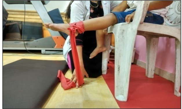
Figure 6: Knee extensors strengthening exercises.

plantarflexors. Gross motor function was tested with GMFM domains D: standing, and E: walking, running, and jumping.