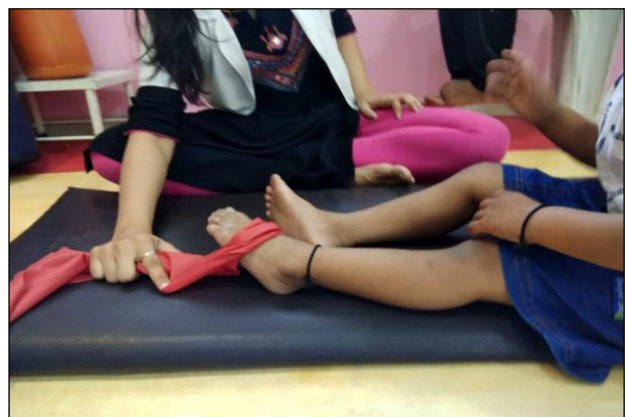
Figure 8: Ankle Dorsiflexors strengthening exercises.

The training period lasted for 6 weeks, three times a week at clinic. Individual programme with three sets of 10 repetitions for each muscle group: first set easy, second medium, and third with a heavy Theraband-10 repetition maximum (10RM). Resistance was provided by