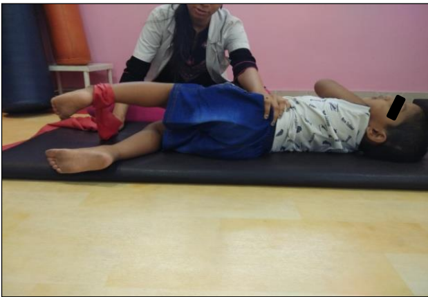
Figure 4: Hip adductors strengthening exercises.