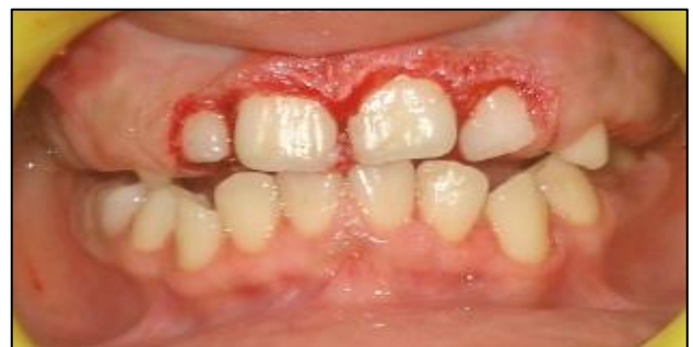
Figure 5: Gingivectomy performed.