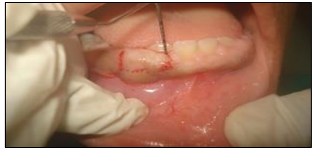
Figure 3: Excisional biopsy.

The patient was evaluated in orthodontic department which confirmed normal skeletal growth. The patient was scheduled for incisional biopsy (Figure 3). The excised tissue was sent to pathology laboratory. The excised area was coagulated with diode laser to achieve hemostasis. On histopathologic examination, proliferative stratified squamous epithelium showed forking and arcing. The connective tissue showed dense collagen fiber bundles with numerous fibroblasts varying from plump to spindle shape (Figure 4). The patient was scheduled for gingivectomy procedure. Considering the non-hemorrhagic nature of the tissue, the gingivectomy was done by scalpel (Figure 5).