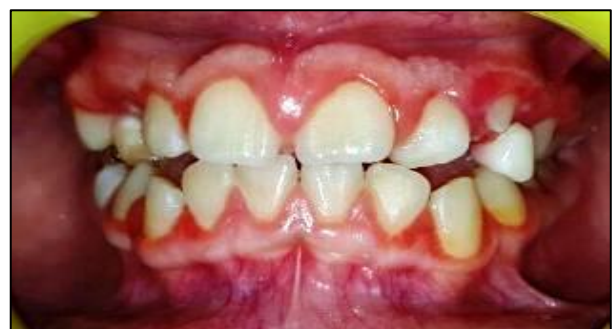
Figure 6: Post-operative frontal view.

There was evidence of coronal migration of gingival margin during healing of the tissue. However satisfactory tooth exposure was present during the recall visit of the patient (Figure 6 and Figure 7). The treatment procedure succeeded in establishing sufficient teeth exposure for mastication.