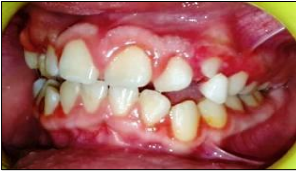
Figure 7: Post-operative left lateral view.