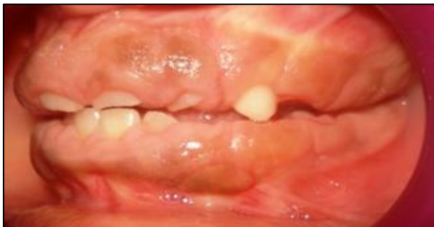
Figure 2: Pre-operative left lateral view.